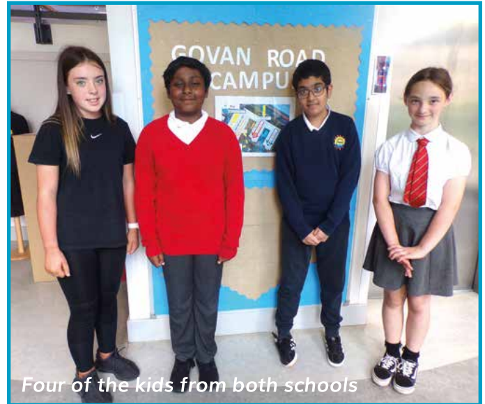
Four of the kids from both schools

"Tenant participation - as every housing professional knows - is a vitally important part of any housing association's work. Moreover, it is important that the ongoing process engages with tenants of all ages – including the young - whose perspective on community can differ greatly from older generations.