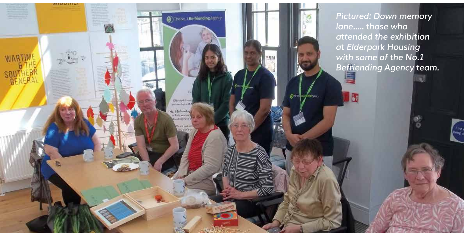
Pictured: Down memory lane..... those who attended the exhibition at Elderpark Housing with some of the No.1 Befriending Agency team.