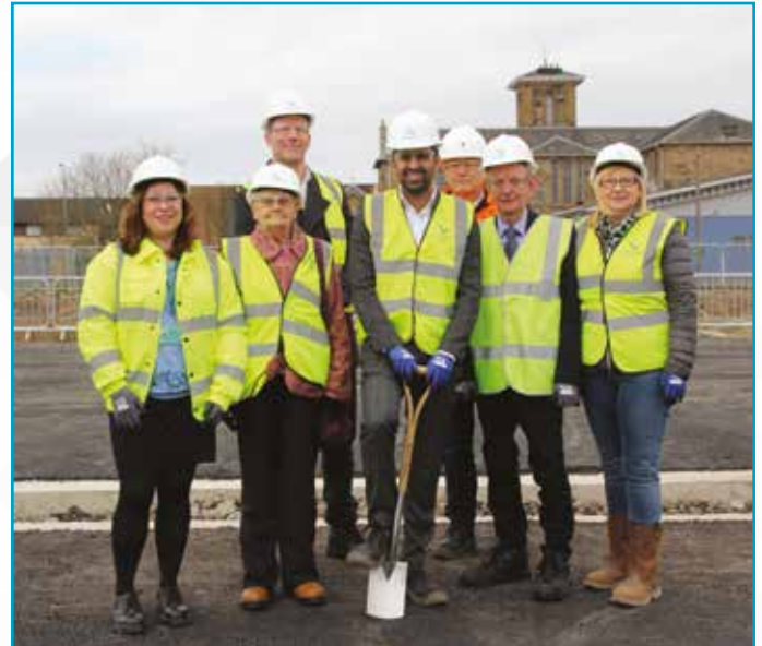
Dig this....Humza Yousaf gets work under way with the Hills Trust school in the background.

Humza Yusaf MSP said: "I was delighted to see at first-hand how this important development will enhance the community with the delivery of new housing. I was also pleased to learn of the wider community regeneration work which Elderpark Housing is undertaking. The new housing and former school restoration is a great example of what can be achieved when the Scottish Government, Glasgow City Council and housing providers like Elderpark Housing work together."